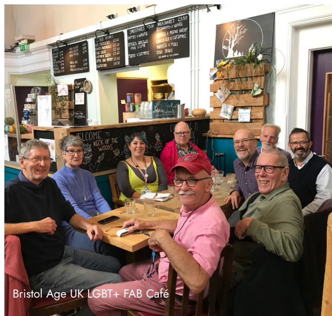
Bristol Age UK LGBT+ FAB Café